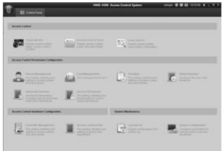
Client Software Interface