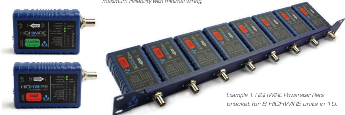
Example 1. HIGHWIRE Powerstar Rack bracket for 8 HIGHWIRE units in 1U.